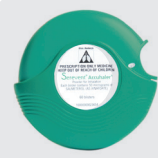
Serevent® Accuhaler® salmeterol