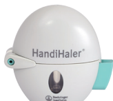
Spiriva® HandiHaler® tiotropium