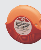
Flixotide® Accuhaler® fluticasone propionate