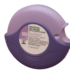
Seretide® Accuhaler® fluticasone propionate/ salmeterol